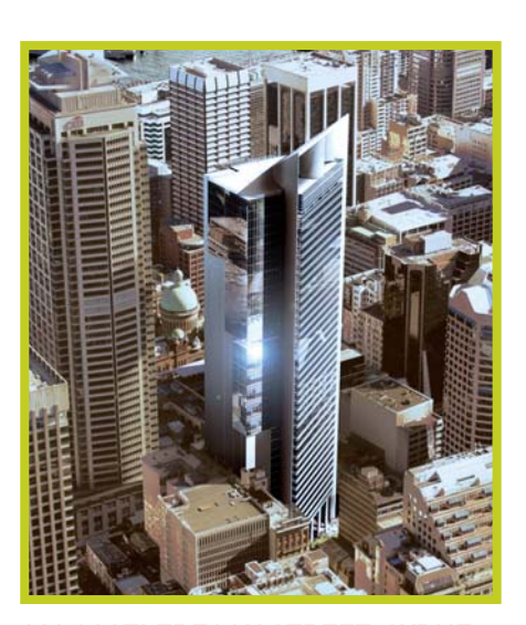
161 CASTLEREAGH STREET, SYDNEY ARTIST'S IMPRESSION

161 Castlereagh Street in Sydney is a new Premium-Grade office tower featuring 54,000 sqm of accommodation over 43 floors. Combined with unrivalled views and a landmark design, the asset will provide new and dynamic public spaces complete with 2,800 sqm of premium ground level retail, extensive transport, parking and wide range of amenities in a prominent Sydney CBD location.