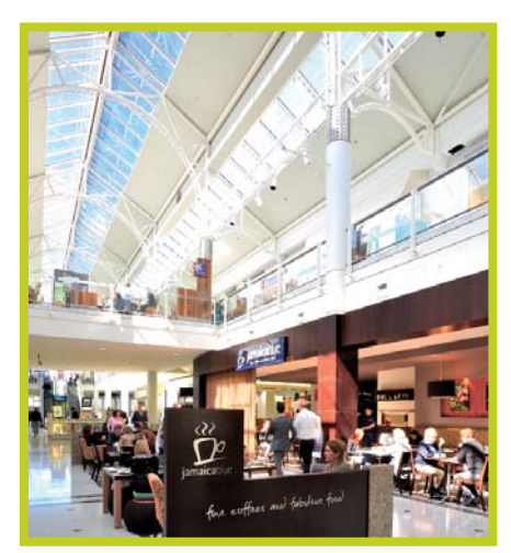
CHARLESTOWN SQUARE, NSW

In August 2010, GPT announced its withdrawal from the proposed $600 million Newcastle development. GPT has instead decided to place its capital towards better alternative development opportunities within the Group's Portfolio. Visit www.gpt.com.au for GPT's full announcement.